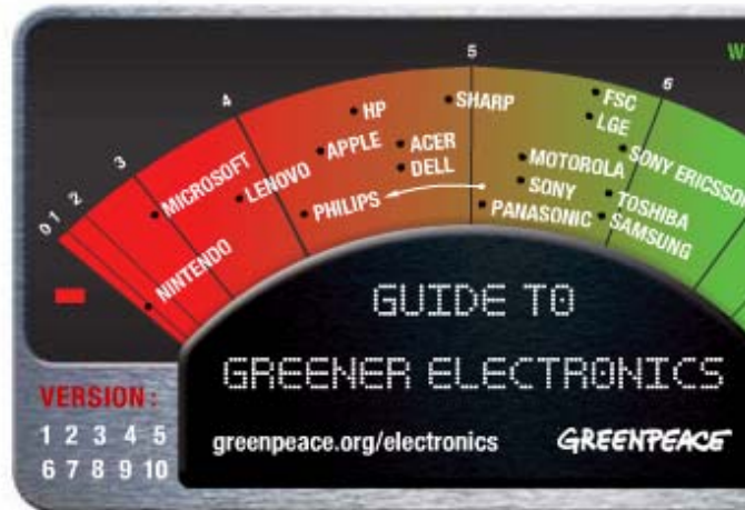
Figure 1. Greenpeace's "Guide to Greener Electronics."

We believe that the combination of RoHS, REACH and the NGOs will continue to create interest by electronics companies to be halogen-free, in a sense just to avoid any hassles. This is evidenced by outside packaging on a Sony Home Theater receiver in which their halogen-free proclamation is listed as part of their "eco info" as shown in Figure 2.