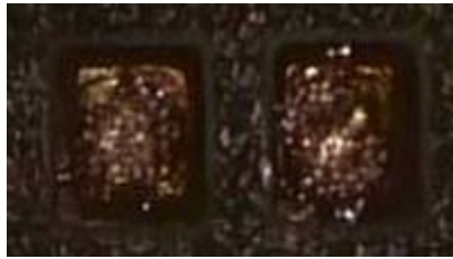
Figure 4. Incomplete Coalescence (aka graping)

Graping occurs when oxide forms on the outside of the printed paste deposit and the activators are not able to remove it. The smaller the deposit, the more surface area exposed to oxidation relative to total flux. Therefore, small deposits such as 0201's put a very high demand on the flux activator. Halogen-free materials will likely be more prone to graping.