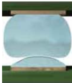
Figure 5. Head-in-Pillow Solder Joint

The second defect likely to become more common during the halogen-free transition is the head-in-pillow defect. Head-in-pillow happens during the reflow process when using a BGA component or PWB that is prone to warping. As the BGA or PWB warps, it creates separation between the ball and the solder paste deposit. At the reflow stage, both the solder paste and the ball go molten, but are not in contact with each other. An oxide layer will build up on the molten solder making it less likely to coalesce together when they come back into contact with one another during cool down. The resultant open solder joint will look like the illustration shown in Figure 5.